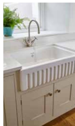
Above: A deep-fitted Belfast type sink sits within the cabinets and offers a traditional touch 'The kitchen is an important living room for us. The children sit at the table and draw, play games or paint and crayon while we prepare meals and catch up with them after school and work. It is also the focus for entertaining - guests always congregate in kitchens at parties and the design of ours facilitates this.'