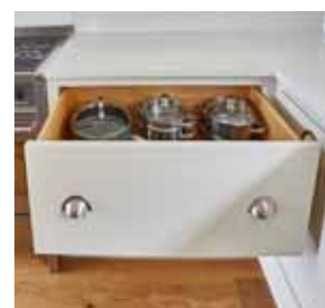
Above: Clever deep drawers offer storage for plenty of pots and pans at the side of the range