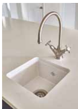
Left: A separate small sink is set into the kitchen island.